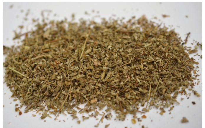
Photograph 2. A sample of plant material as seen by the naked eye.

Other synthetic cannabinoids detected between May and December 2017 include: